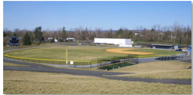
Baseball Field – Home of the Chambersburg Trojans

Their seasons are underway if you'd like to take in a game this spring. Their schedules can be found on our website under the Park Information page.