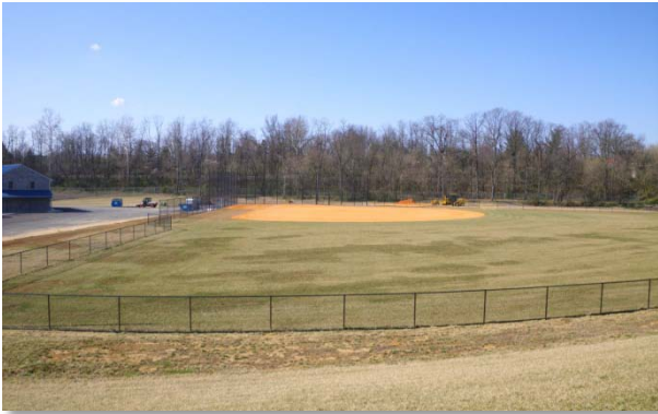
New Baseball/Softball Field

The Greene Township Park will include a few new facilities this spring and summer. Nearly complete is the new baseball/softball field located next to the existing baseball field. It will be open for public use sometime this spring. Contact the Township office to schedule events on the field.