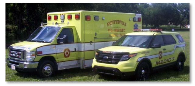
Fayetteville Volunteer – Ambulance 7-6 and Medic 7

Greene Township citizens and visitors have four volunteer fire departments that provide first due fire and EMS services. The four departments are Fayetteville Volunteer Fire Department, Franklin Volunteer Fire Department, Pleasant Hall Volunteer Fire Department, and West End Volunteer Fire and Rescue. All of these departments depend on donations and fundraisers to purchase equipment and provide training to the volunteers.