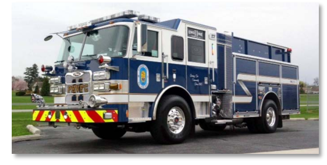
Pleasant Hall Volunteer - Engine

These departments respond to fires, car accidents, water rescues, medical calls, and numerous other calls. The men and women give up time with their families to come out and help during an emergency, fund raising activities and public education. The volunteer departments save thousands of dollars by providing these services. Please show your support by donating to any of the departments. If you are interested in becoming a volunteer please contact your local fire department or Greene Township.