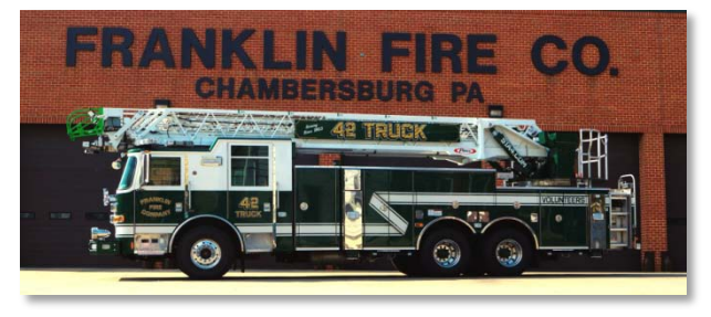
Franklin Volunteer – Ladder Truck

Greene Township citizens and visitors have four volunteer fire departments that provide first due fire and EMS services. The four departments are Fayetteville Volunteer Fire Department, Franklin Volunteer Fire Department, Pleasant Hall Volunteer Fire Department, and West End Volunteer Fire and Rescue. All of these departments depend on donations and fundraisers to purchase equipment and provide training to the volunteers.